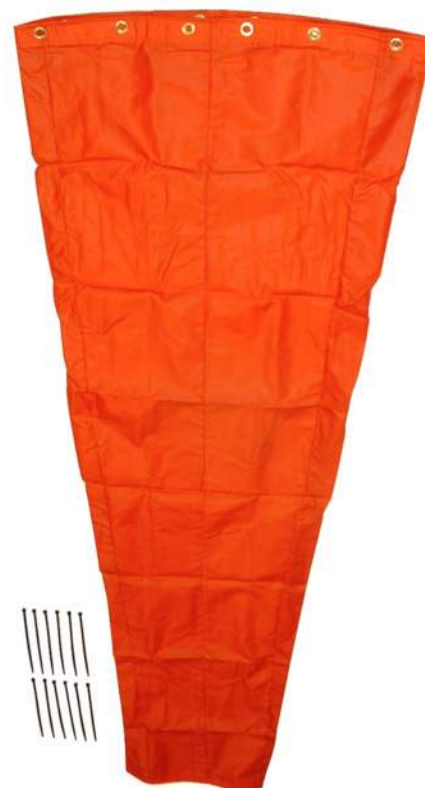
HP0192 Replacement Windsock