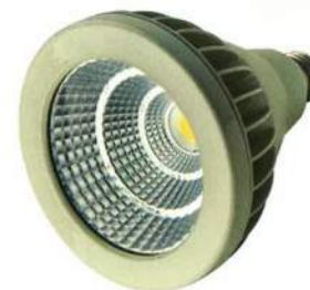
HP0721 LED Par 38 Spotlight