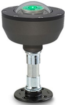
AC POLE MOUNTED PERIMETER LIGHT

HP0270 Pole Optional. Pole not included.