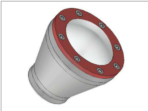
View Interactive 3D Image Must use Adobe Reader or Acrobat

HP0270 Pole Optional. Pole not included.