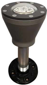
DC POLE MOUNT PERIMETER/ L-810 OBSTRUCTION LIGHT

HP0270 Pole Optional. Pole not included.