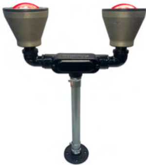
DUAL RED OBSTRUCTION LIGHT

FEC offers a dual obstruction light for added safety and minimal maintenance in remote locations.