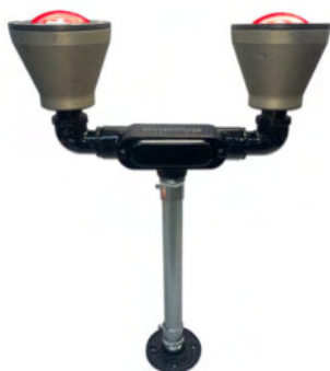
DUAL RED OBSTRUCTION LIGHT

FEC offers a dual obstruction light for added safety and minimal maintenance in remote locations.